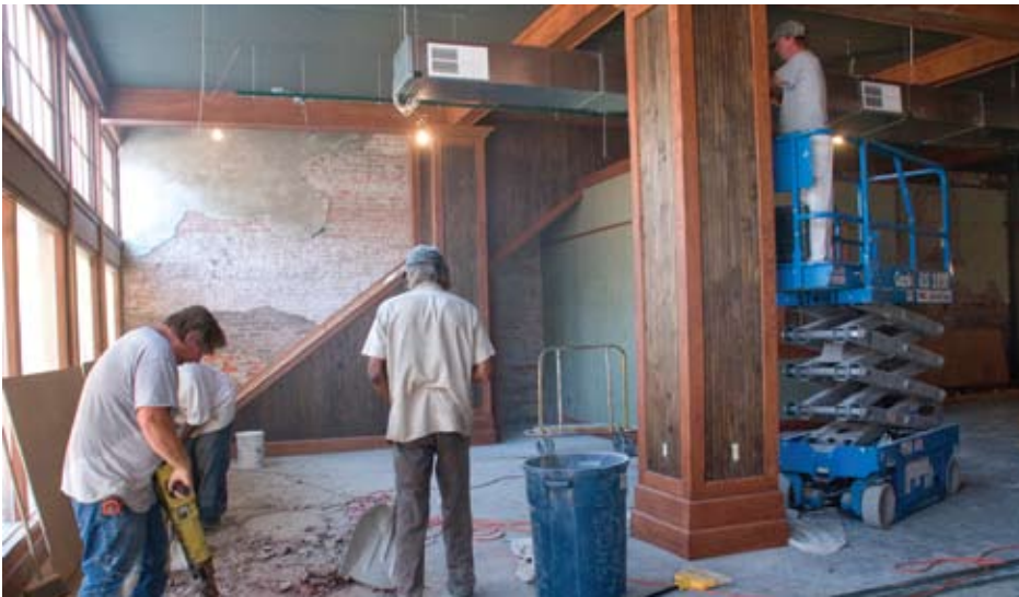
On Howard Street , Greenwood's main retail street, another old building is being renovated by Viking, this one for a furniture store. Also on Howard Street, visitors will find one of the handful of markers in the area that are part of the Mississippi Blues Trail. Among the famous blues musicians with connections to the area are B.B. King and Robert Johnson.