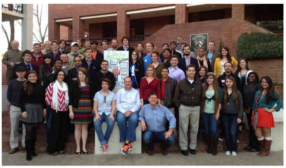
2013 Startup Weekend-73 participants pitched 37 ideas.

graphic artists and businessminded people are able to build and develop ideas. Companies that are not based on software or Internet-related products are also encouraged to participate, as the weekend is an incredible opportunity to collaborate on a market-