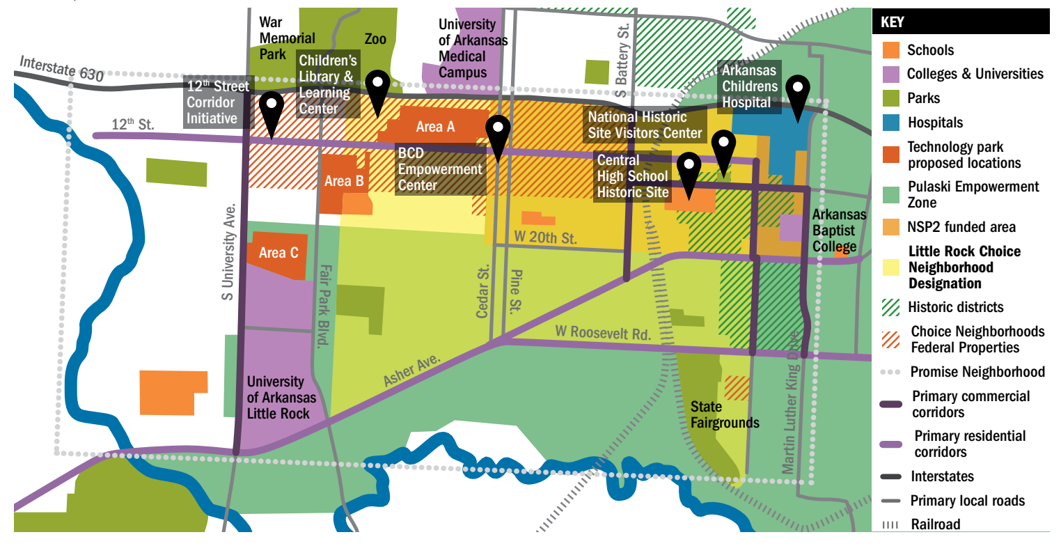
FIGURE 1 | Little Rock Choice Neighborhood Anchor Institutions and Assets

The Brookings Institution has reported several advantages of linking "eds and meds" (educational and medical institutions) to economic development, including job creation, improve-