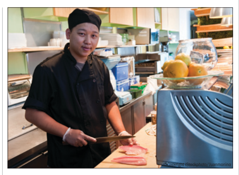
Immigrants are almost 30 percent more likely to start a new business than native citizens living in the U.S.

Foreign-born individuals have a higher rate of entrepreneurship than U.S.-born individuals, especially in technology and