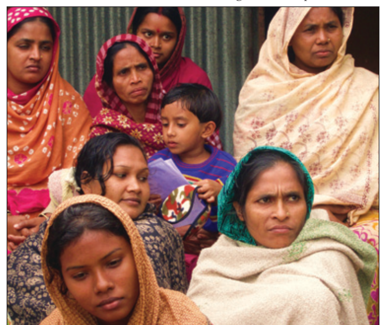
Rural microloan borrowers gather for a weekly group meeting.

microfinance has served as a catalyst to alleviate poverty and nurture social entrepreneurship in Bangladesh. I hoped to witness