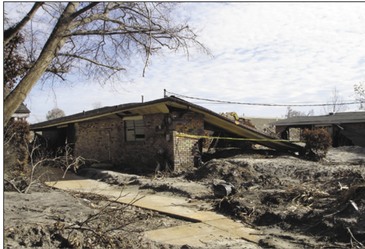
One of many homes destroyed by Hurricane Katrina.

To review the program, visit the Federal Home Loan Bank of Cincinnati's web site, www.fhlbcin.com .