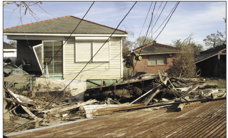
More destruction in Louisiana.