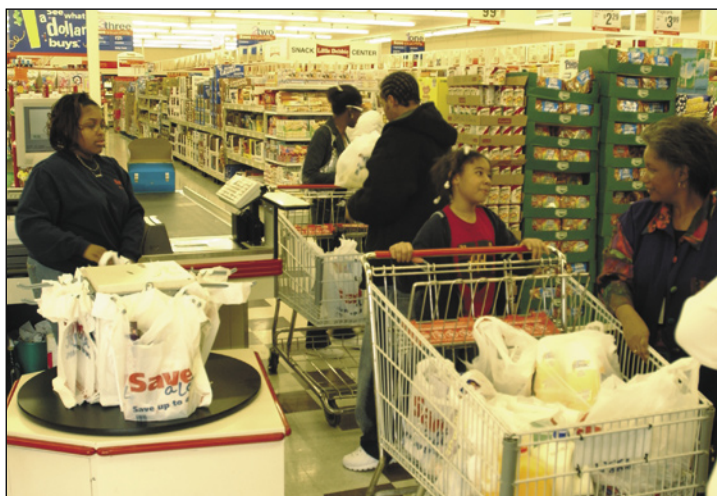
This Save-A-Lot grocery store at 1804 Dixie Hwy. (18th Street) in Louisville, occupies what was once a vacant “big box.”

The trend of building new super stores has left a trail of vacant big boxes scattered throughout cities and towns. Rural, urban and suburban communities are all struggling with the reuse of vacant, large retail space.