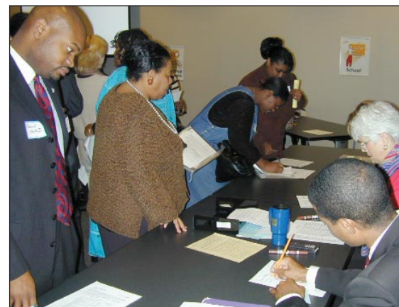
Participants in the debt simulation in Memphis line up to conduct business at the “bank.”

Before the first round of the simulation, each family was given time to review its situation and develop a plan of action. During the first round, each family had certain business to transact, including getting the children to school, visiting the bank and buying food at the grocery store. Stations representing places the family members would go to conduct their daily business were set up along the perimeter of the room.