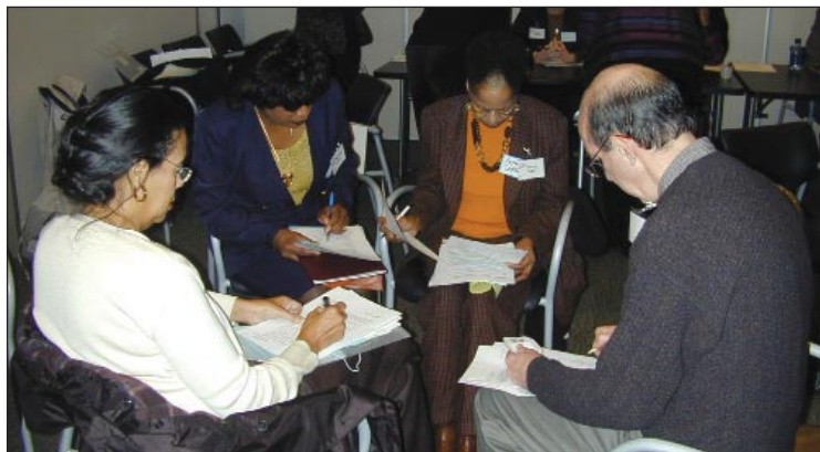
A family works together on a plan that will help it avoid bankruptcy.