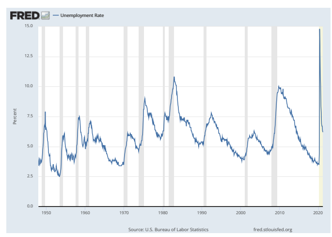
SOURCE: FRED®, Federal Reserve Bank of St. Louis; the most recent end date is undecided, U.S. recessions are shaded. https://fred.stlouisfed.org/graph/?g=xvvl

actions relied on traditional tools that the Fed uses when the economy slows, while others were nontraditional measures only used in times of severe stress. Its actions can be classified into three categories. First, it used its standard interest rate policy tool. Second, it used balance sheet policy, meaning purchases of "government" securities. Third, it deployed other liquidity and credit measures that predominantly included the establishment of emergency lending facilities.