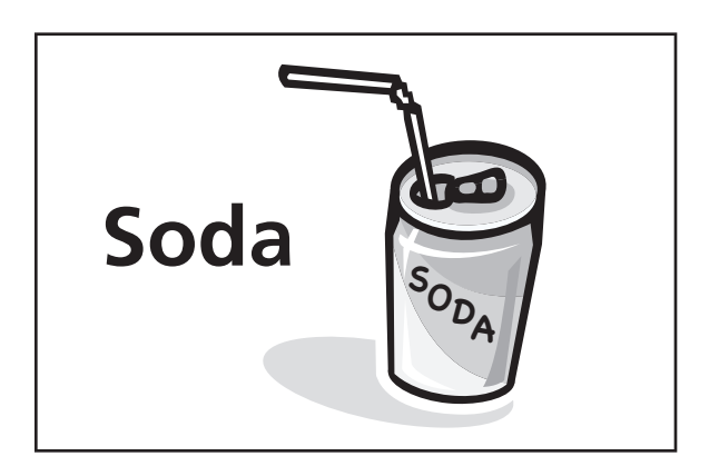
Visual 2: Matching Example