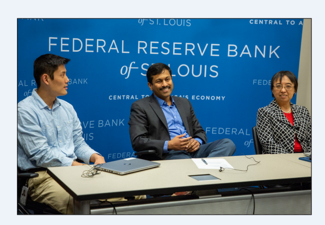
Members of the Asian ERG participated in an Allied Voices podcast.