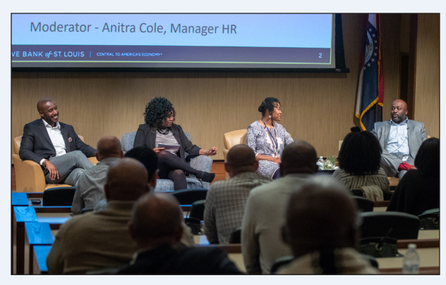
Senior Bank leaders participated in a panel discussion on The Untold Stories of Black Excellence, sponsored by the AACTIVE ERG.