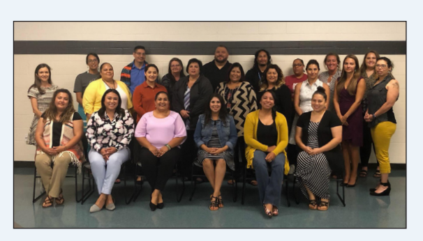
Educators from tribes in Anadarko, Okla., area participate in personal finance workshops in July 2019.