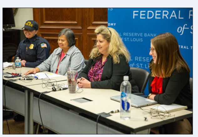
Women from the VIEW ERG discussed their career journeys and the importance of allies for the Bank's first Allied Voices podcast.