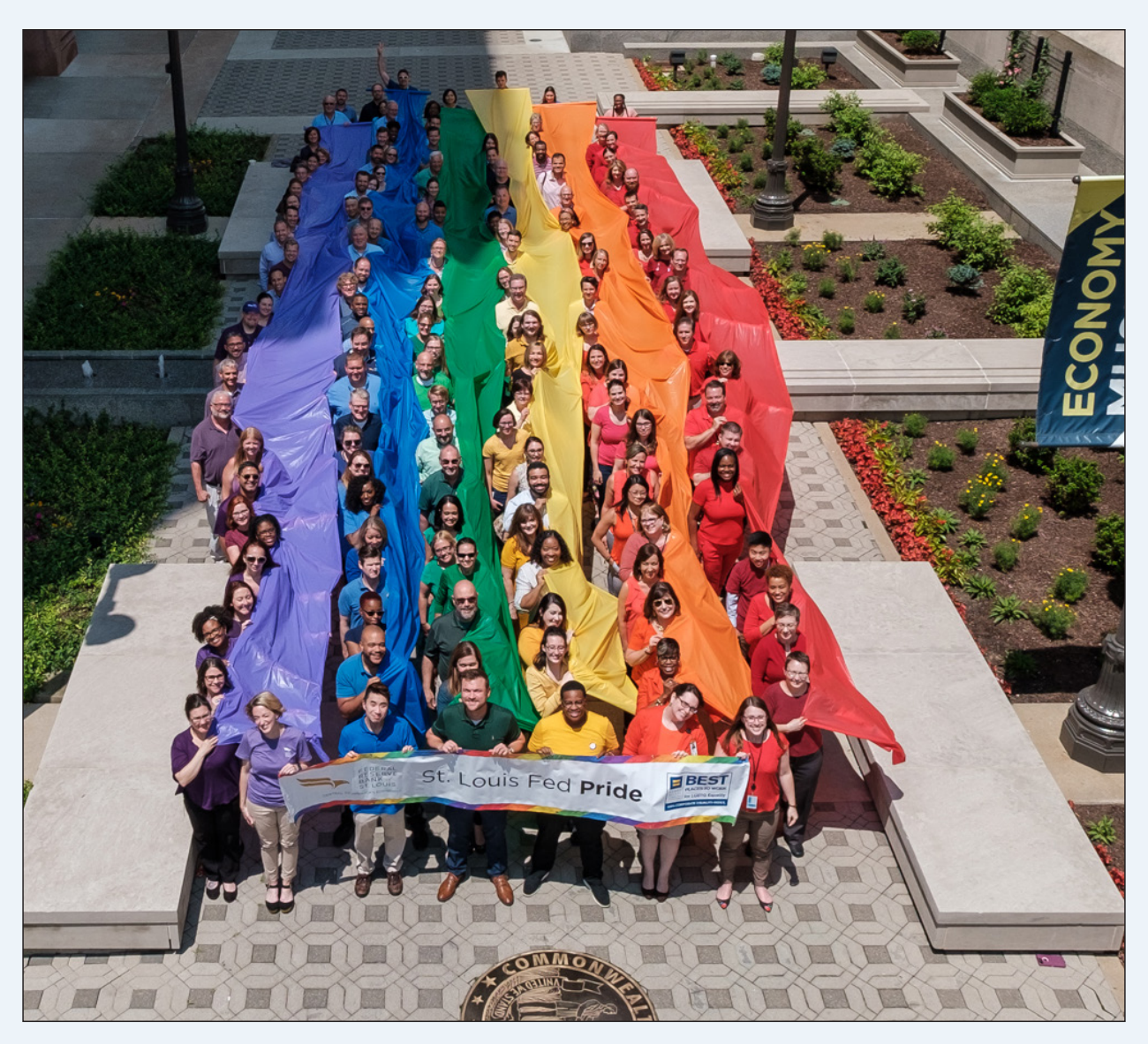
To commemorate Pride Month, St. Louis Fed employees created a human Pride flag on the Bank's plaza.