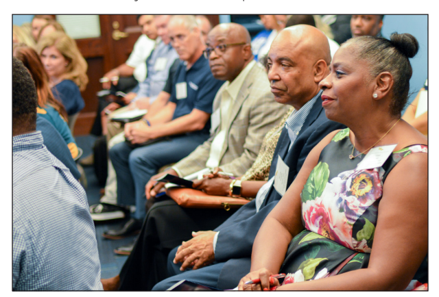
Supplier Diversity Workshop

In 2019, the Bank participated in diversity and outreach efforts while integrating supplier diversity best practices into standardized business processes. The Bank continued to focus on communicating and identifying more opportunities for all departments to engage in its supplier diversity efforts through strategic partnerships. The Bank has continued to explore new opportunities to promote an inclusive environment and identify new suppliers to invite into its community outreach and procurement events.