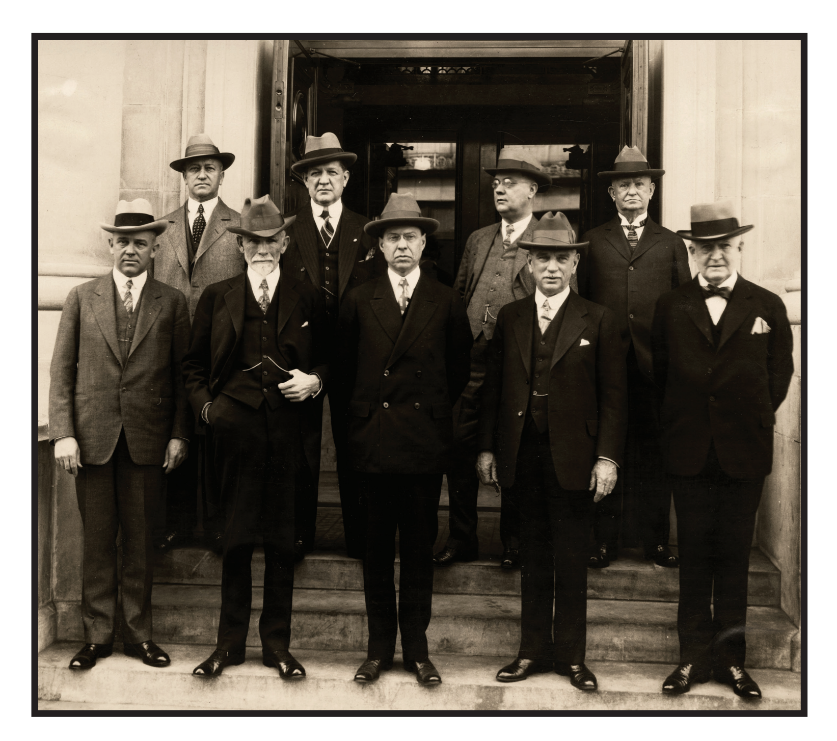
Members of the board of directors pose on the steps of the St. Louis Fed in the 1920s.