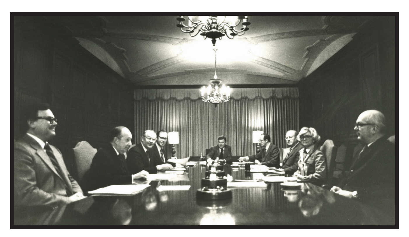
Board of Directors, St. Louis, 1978