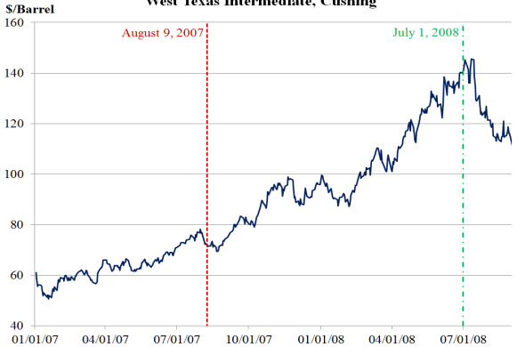
FIGURE: Oil prices (WTI) increased from about $70 per barrel when the crisis began to more than $140 per barrel the following summer.