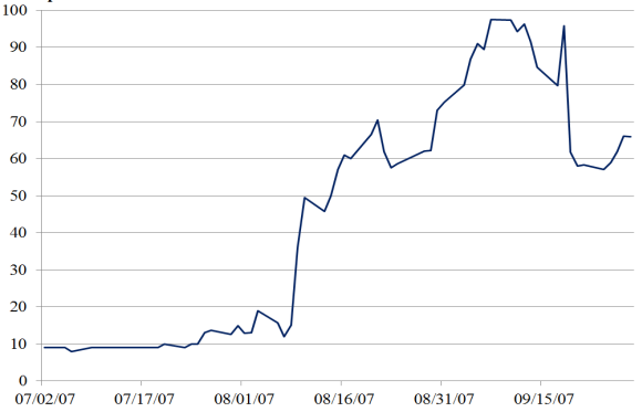
FIGURE: The Libor-OIS spread began rising substantially August 9-10, 2007, an indication the financial crisis had begun in earnest.