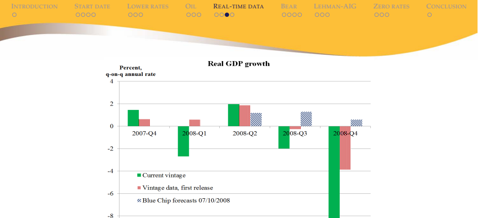
FIGURE: The real GDP data available as of August 2008 suggested the U.S. economy continued to grow at a modest pace. Forecasts predicted more of the same.