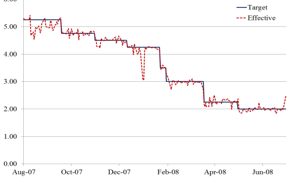
FIGURE: The FOMC lowered the policy rate target steadily during the first 9 months of the crisis.