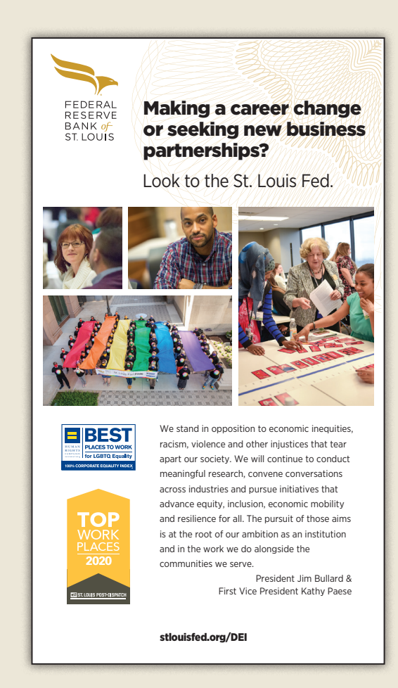
The Bank participated in the St. Louis American's Diversity Imperative issue.

GFE questionnaires, which the System believes would increase the number of competitive bidding events and, ultimately, the number of diverse businesses partnering with the Federal Reserve System.