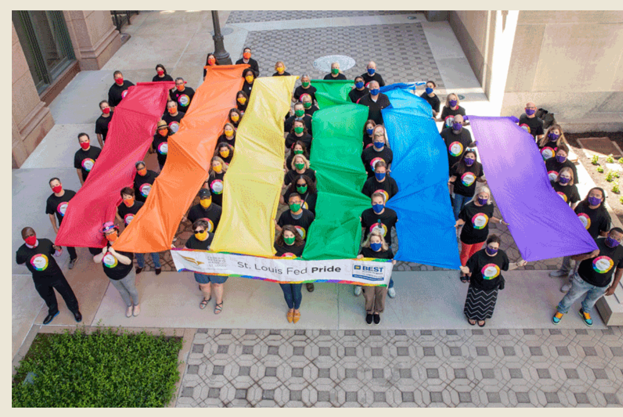
The St. Louis Fed's Central Pride ERG organized a human rainbow of employees on the Bank's plaza to commemorate Pride Month.

The Asian ERG also collaborated on several programs with other ERGs including: